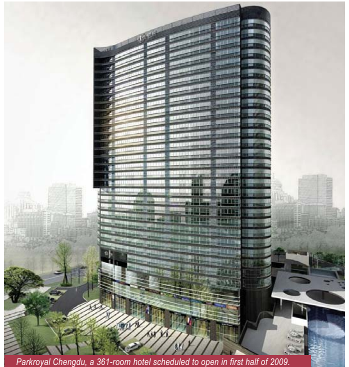
Parkroyal Chengdu, a 361-room hotel scheduled to open in first half of 2009.

Chengdu's location, adjacent to the eastern border of Tibet, and its rich cultural heritage dating back over 2,000 years, make it one of the most beautiful cities in China and one of the fastest growing tourist