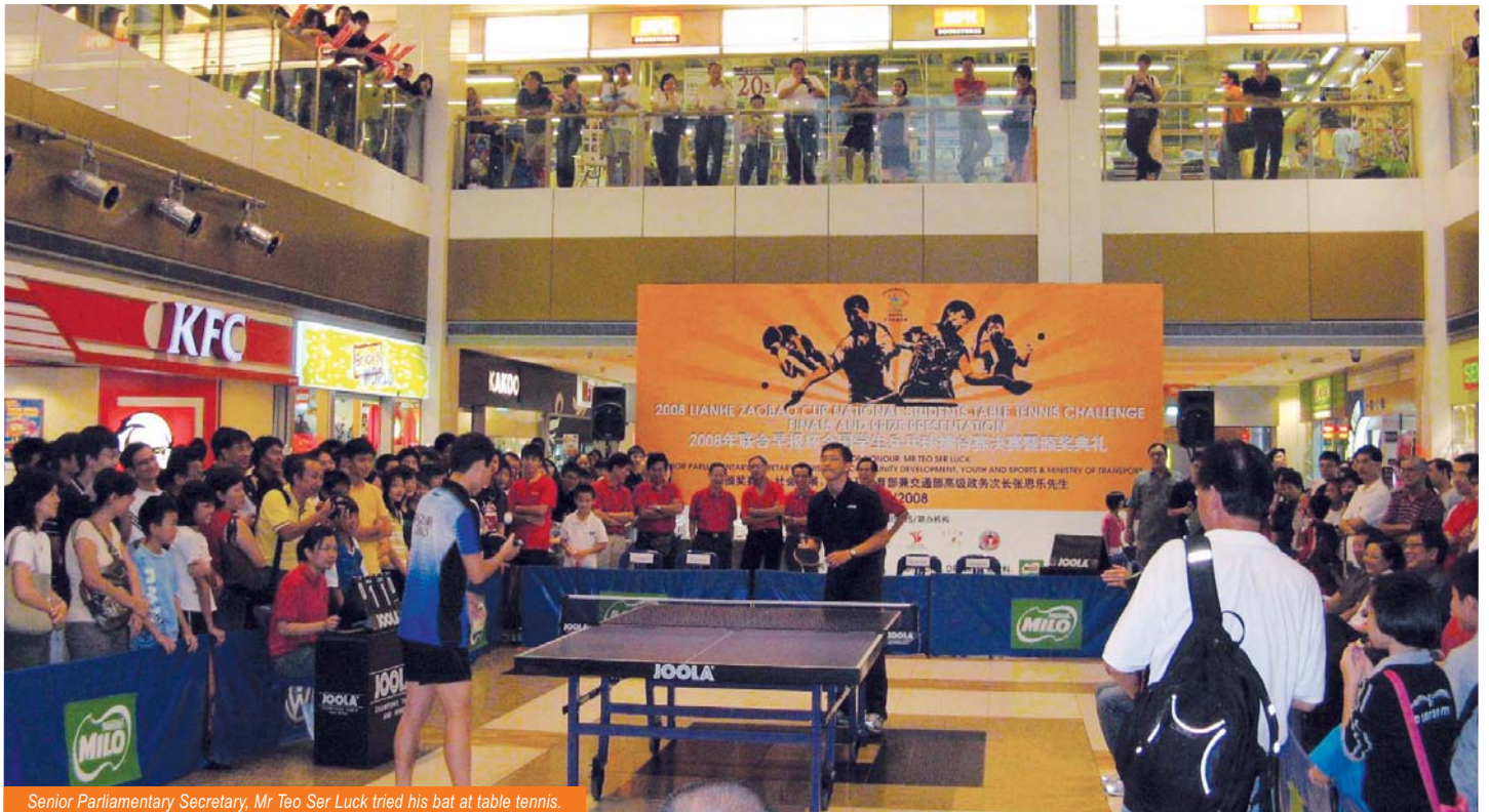
Senior Parliamentary Secretary, Mr Teo Ser Luck tried his bat at table tennis.

In collaboration with Lianhe Zaobao, Velocity brought the 10th Lianhe Zaobao Cup National Students Table Tennis Challenge Finals to the shopping mall on 25 May 2008. Velocity scored a double first, with the organizers bringing the competition to a public venue and having it in a shopping mall.