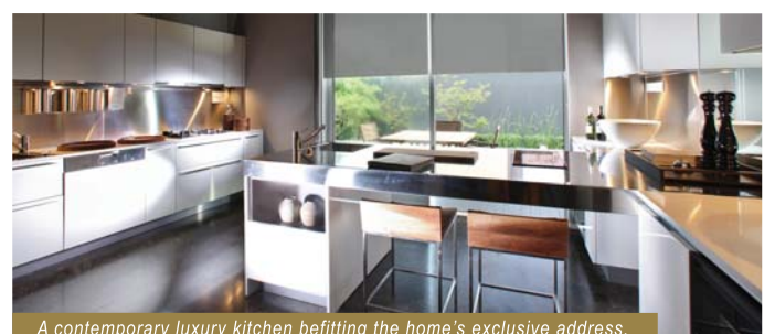
A contemporary luxury kitchen befitting the home's exclusive address.

The project is developed jointly with Kheng Leong Co. and Japan's Orix Corporation.