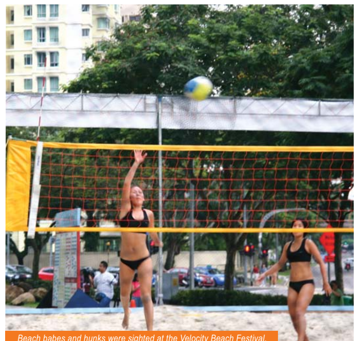
Beach babes and hunks were sighted at the Velocity Beach Festival.

for the sand court and organised exciting competitions like the 2-on-2 beach volleyball, 3-on-3 beach soccer as well as beach tchoukball competitions. There was a 60% increase in the number of teams who participated in the beach volleyball competitions. For the 3-on-3 beach soccer competition in its inaugural year, it attracted a total of 76 teams.