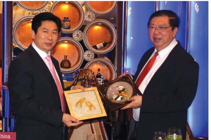
The partnership between Parkroyal and Chengdu Xinda paves the way for Parkroyal's expansion into China.