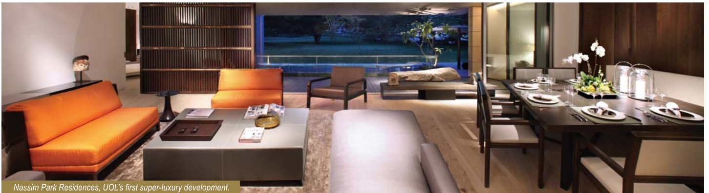
Nassim Park Residences, UOL's first super-luxury development.

Nassim Park Residences, UOL Group's super-luxury project, is the pinnacle of luxury living. Launched in June and priced from $10 million upwards, Nassim Park Residences is undoubtedly in the best luxury location in Singapore.