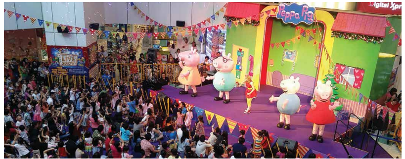
> Peppa Pig's first 'live' show in Singapore at United Square.

The festive spirit continued at OneKM, where Peppa's Christmas Surprise Workshops let kids unleash their creativity and create their own art masterpiece. The Little Big Club's Thomas the Tank Engine, Barney & Friends, and Fireman Sam also performed at OneKM.