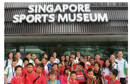
> The children and volunteers had an enjoyable time exploring Singapore's sports history together.