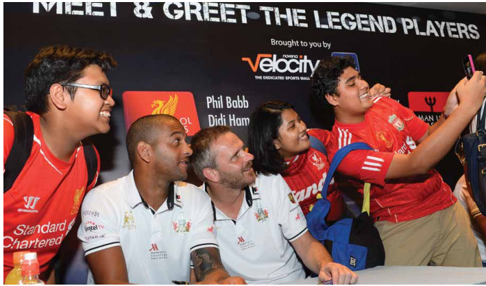
> Fans taking a 'wefie' with the Liverpool Masters Players.